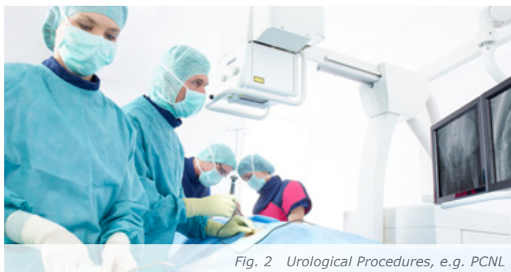
Fig. 2 Urological Procedures, e.g. PCNL