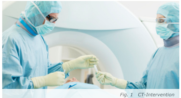
Fig. 1 CT-Intervention

The figures 1 and 2 exemplify typical medical procedures involving X-Ray radiation without a sufficient radiation protective shield.