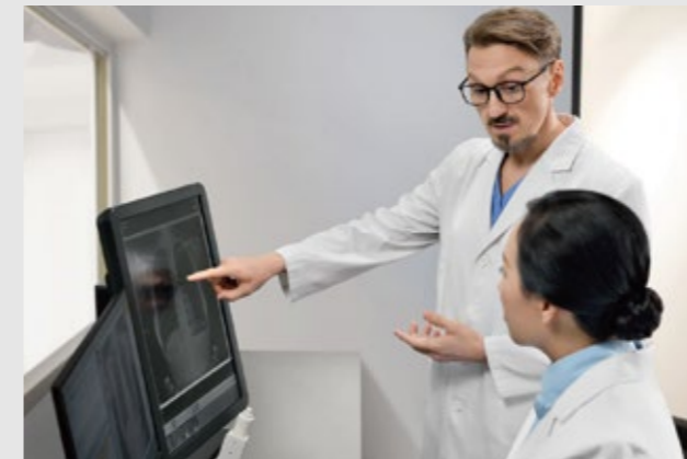
Humanized workflow for flowy operation