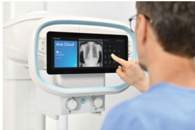
12.3 inch slim touch-screen