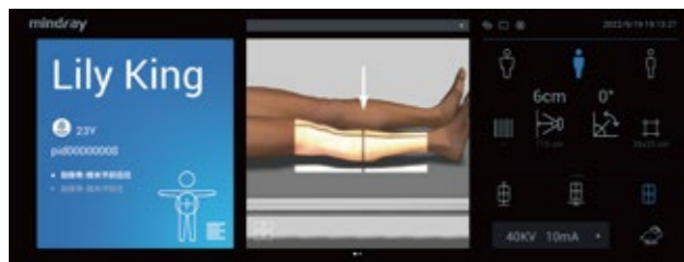
Synchronized operation with workstation