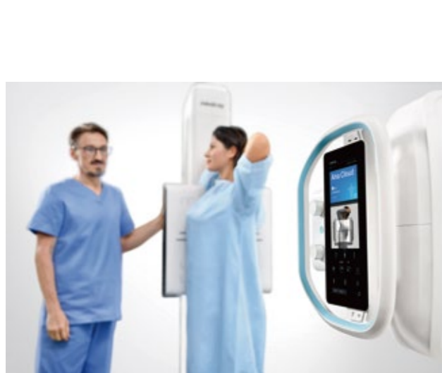
Obvious font design, confirming patient information before exposure

Pay more care to patient, and reduce visual fatigue of radiographer