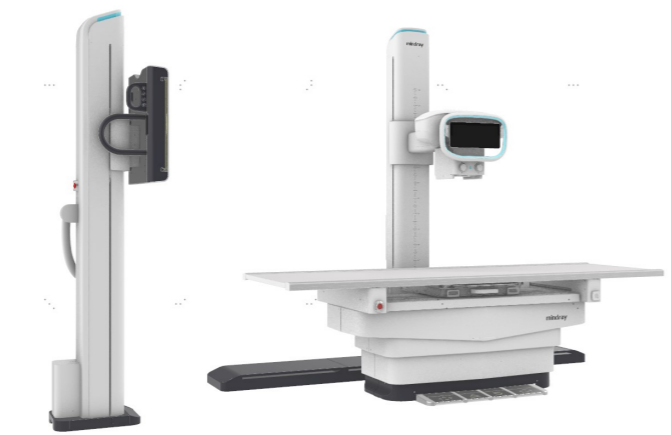
Elevated table version available