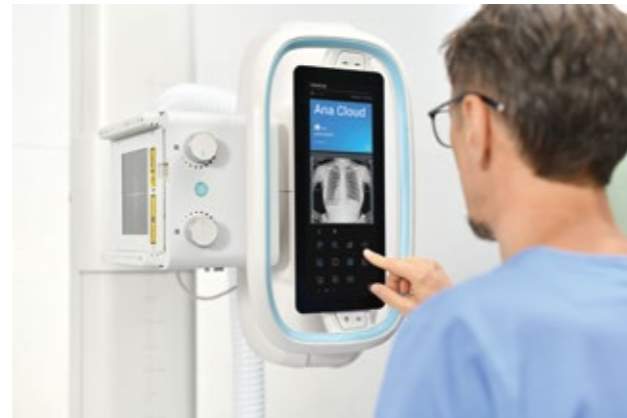
Adaptive UI, humanized workflow