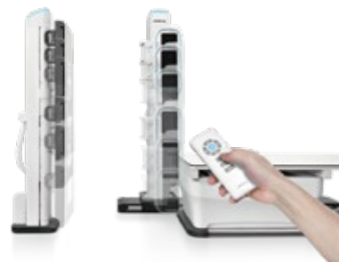
Bidirectional synchronization of the tube and bucky